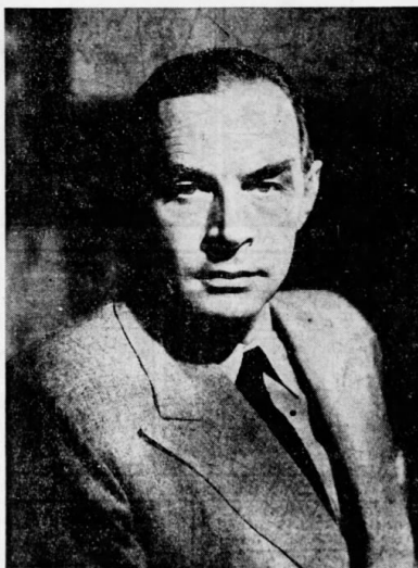
ERICH REMARQUE, AUTHOR OF "ALL QUIET ON THE WESTERN FRONT," WHOSE NEW BOOK, "ARCH OF TRIUMPH," IS A CURRENT BEST SELLER.

On the eve of Hitler's ascendancy in 1931, Remarque renounced his native land and moved to Ascona, Switzerland, where he continued his writing.